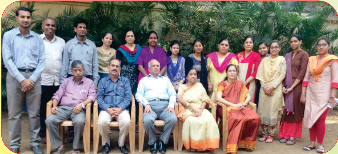
DEGREE COLLEGE STAFF