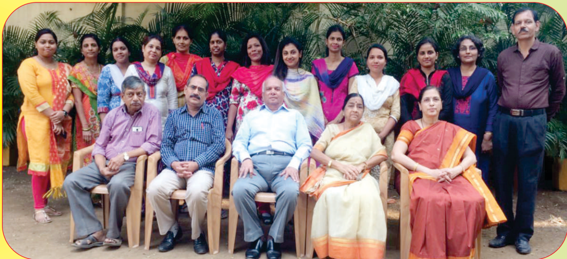
JUNIOR COLLEGE STAFF